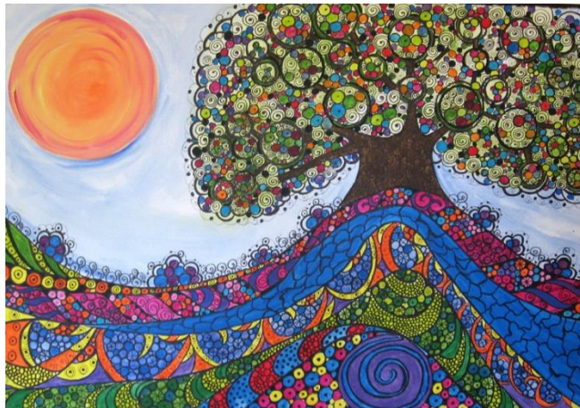
The Tree of Hope