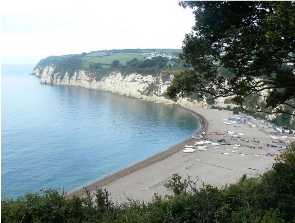
Beer beach in Devon